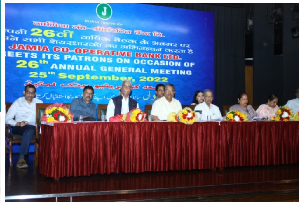
Board of Directors of the Jamia Cooperative Bank Ltd. On the occasion of 26th Annual General Meeting of the Bank held on 25th September, 2022

Batla House : 011-41775324 (IFSC Code : UTIB0SJCB01) Sarai Jullena : 011-40538942 (IFSC Code : UTIB0SJCB02) Abul Fazal Enclave : 011-46022336 (IFSC Code : UTIB0SJCB03) Madanpur Khadar : 9311421693 (IFSC Code : UTIB0SJCB04) Zakir Nagar : 011-47360124 (IFSC Code : UTIB0SJCB05) Sangam Vihar : 011-71219807 (IFSC Code : UTIB0SJCB06) Jasola Village : 011-45642786 (IFSC Code : UTIB0SJCB07) Badarpur : 011-26660209 (IFSC Code : UTIB0SJCB08)